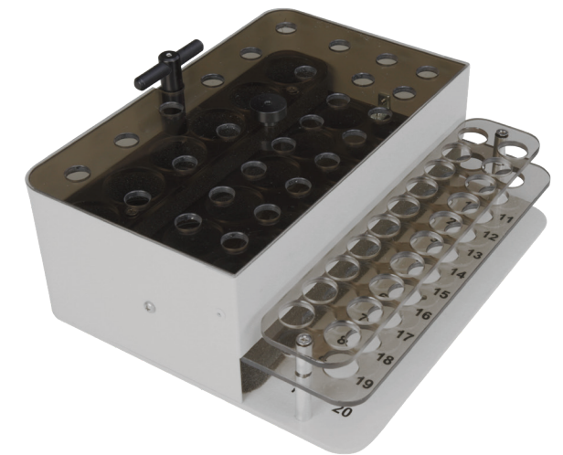
Optional insulated reagent and sample rack (available with or without barcode)