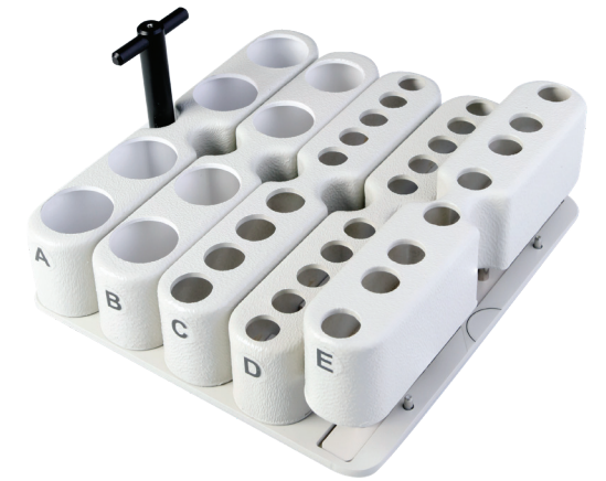
Universal rack Optional interchangeable segments available

REPORT - create reports by assay, by patient, by date range and more